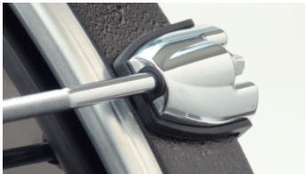
Protegos Sunk-in Tension Screws All tension screws are sunk in the claw hooks. This avoids injuries while playing and...