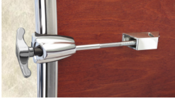
Tab Screws chromed