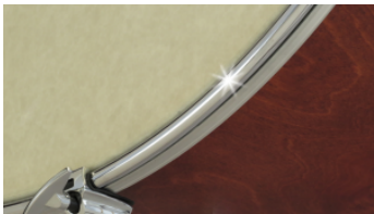
Steel rims The rims are made of tempered high-quality steel to ensure a smooth power transfer at any point of the fleshhoop.

Depending on the head tension, the rims are flush with the shell edge or even stand back behind it.