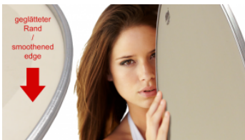
Renaissance Renaissance Heads are similar to natural skin heads with regards to sound and appearance. They feature a warm, dark, focused ...