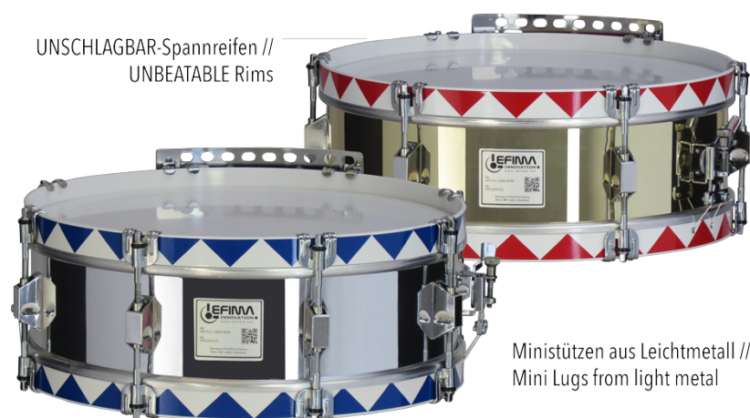
UNSCHLAGBAR-Spannreifen // UNBEATABLE Rims

Detailed information can be found at www.lefima.de