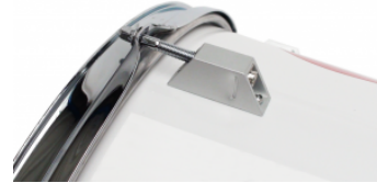
Mini Lugs made from light metal