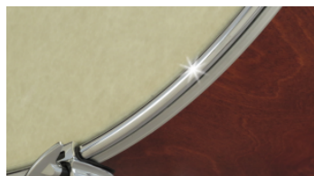
Steel rims The rims are made of tempered high-quality steel to ensure a smooth power transfer at any point of the fleshhoop.

Depending on the head tension, the rims are flush with the shell edge or even stand back behind it.