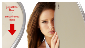
Renaissance Renaissance Heads are similar to natural skin heads with regards to sound and appearance.They feature a warm, dark, focused ...