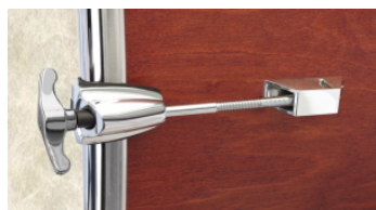
Tab Screws chromed