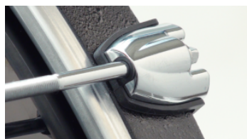
Protegos Sunk-in Tension ScrewsAll tension screws are sunk in the claw hooks. This avoids injuries while playing and...